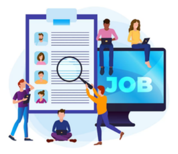
Advanced Job Portal Application

Are you tired of the complexities of job hunting and recruitment? Look no further! Accurate Job Portal is the allin-one job portal app designed to streamline the job search process for candidates and simplify talent acquisition for employers. With powerful features for Admins, Candidates, and Employers, we bring together the perfect combination of convenience and efficiency.